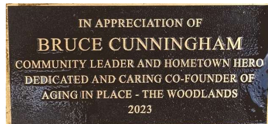
Plaque on the bench